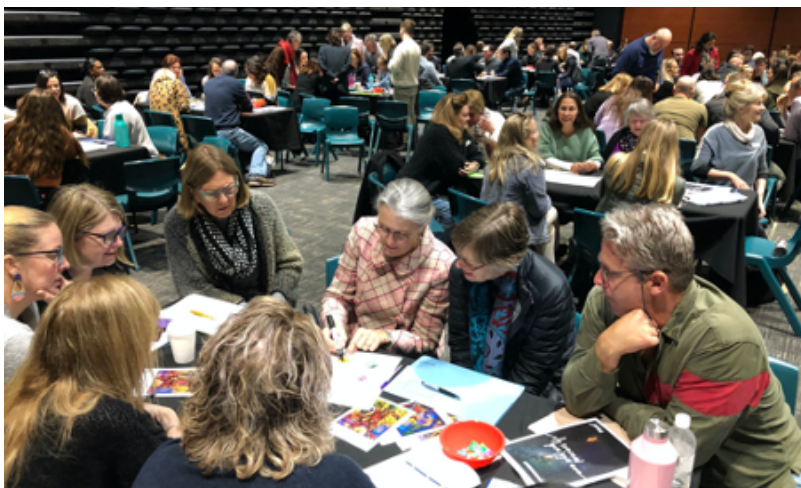
Staff from Newman College Perth gathered at the OW&PL program

It was a wonderful way to give thanks for the many blessings in their lives and a reminder of their call as Marists to continue Champagnat's dream in 2020, to take the Good News of the Gospel to the young.