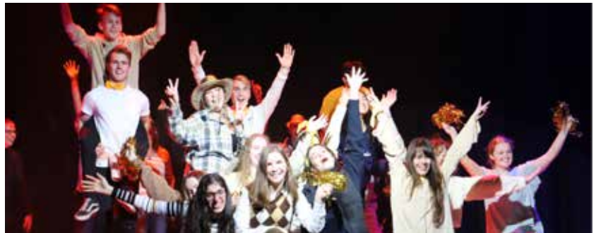
Above: Feast Day 'Fair Day' and talent show at Marist Catholic College Penshurst.