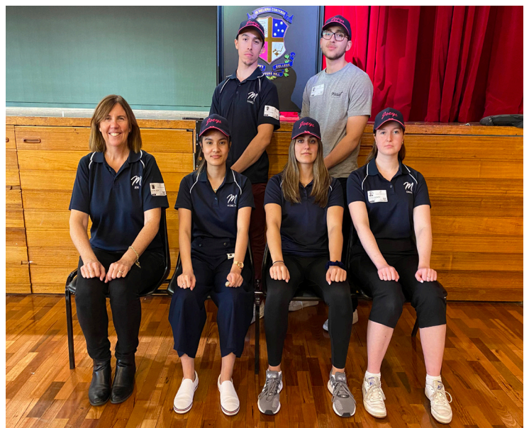
MYM Team in their 'Joeys' caps trying hard to replicate the Joeys boys!