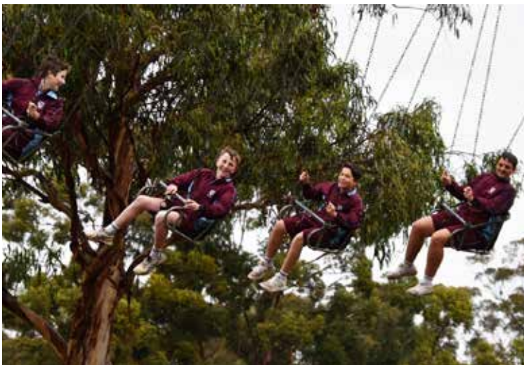
Above: St Gregory's College, Campbelltown