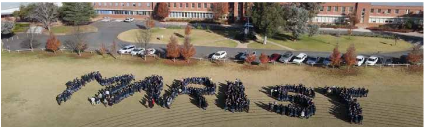
Above: Red Bend Catholic College, Forbes