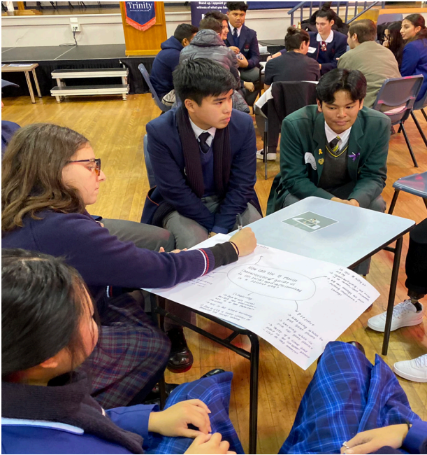
Inner West Local Connect Photos