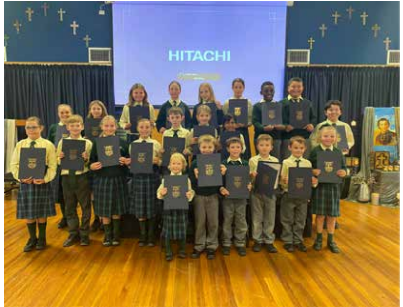
Above: 2021 Champagnat Awards at Holy Family Parish School, Parkes.