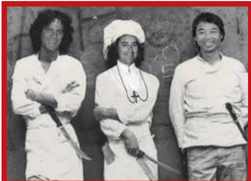
Left: Pick the Brother...