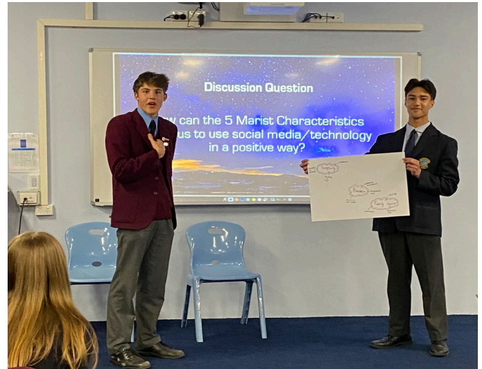
Macarthur Connect photos

After successfully hosting our first local Connect at Randwick on 2 June, featured in the last MSA Newsletter, the MYM Sydney team continued to present at the Inner West Local Connect at Trinity Catholic College, Auburn on 11 June and the Macarthur Connect held at St Gregory's College, Campbelltown on Friday, 18 June. It was great to see students from St Patrick's College, Dundas, Parramatta Marist High School, Cerdon College, Merrylands, and Mount Carmel Varroville join with students from these host schools to discuss the dilemma that is social media and how to live our best lives whilst 'on line' using the 5 Marist characteristics as a guide!