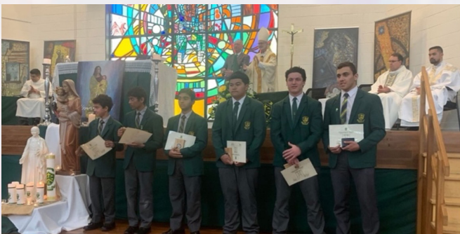
Parramatta Marist High School students are presented with Champagnat Day Awards

Dignity has the potential to change the world, but only if we help to spread its profound message. By honouring other people's dignity, we honour our own.