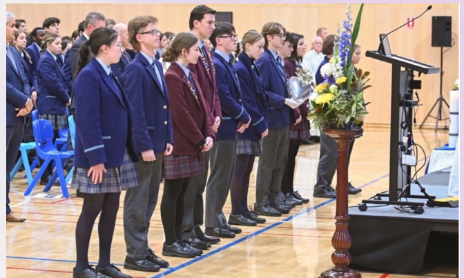
Champagnat Day Mass at Sacred Heart College, Adelaide