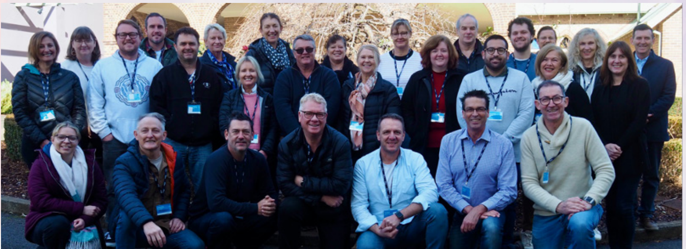
Footsteps 2 Participants, 7 – 10 August 2022