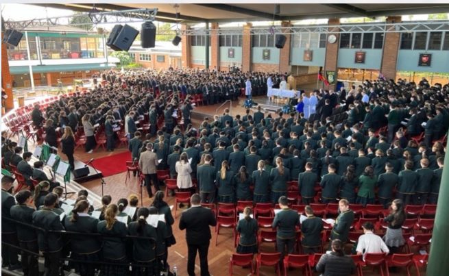
St Patrick's Marist College, Dundas celebrates Mass for the Feast of St Marcellin Champagnat

Our Marist Schools across the country held Champagnat Day Masses, Awards Ceremonies and fun activities to celebrate our Founder, St Marcellin Champagnat.