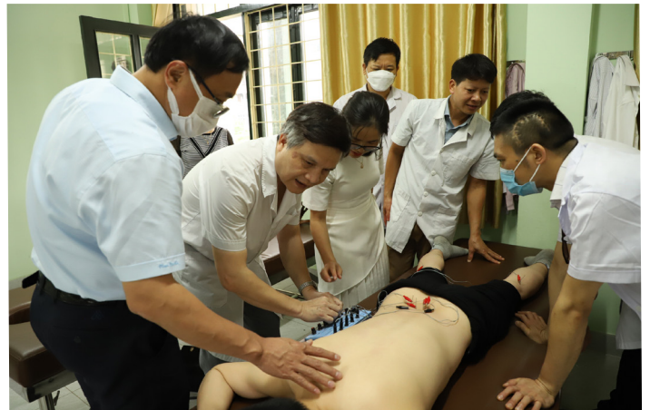
Students taking part in acupuncture class.