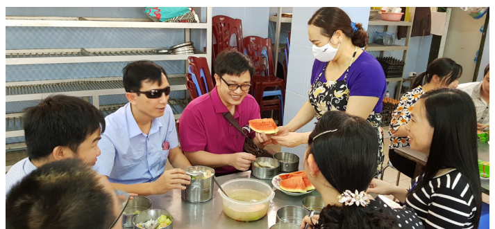
Students enjoying a meal provide with accommodation at the Centre

Visually impaired students are recruited from all provinces of Vietnam, several of whom live in remote, mountainous areas and are from ethnic minorities. This means that the approach and training can be complex and encompasses many aspects such as the psychological state of the students, physical limitations, levels of sightedness, age and prior living conditions. Accommodations and meals are provided for all students so that they may stay at the Centre and devote their time to learning.