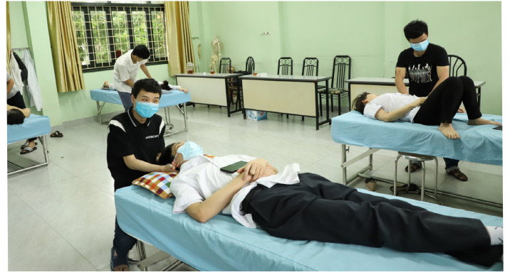
Students taking part in a traditional massage class.

We are nearing the end of the year, a reminder to send your donations into AMS before the school year ends!