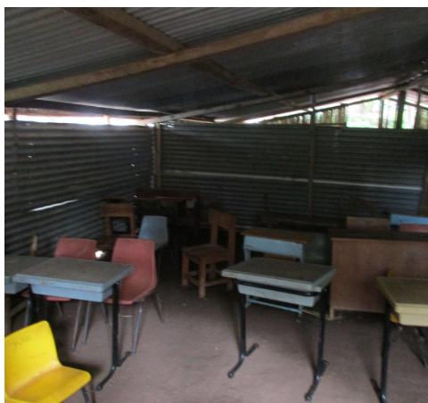
The old furniture needing replacement