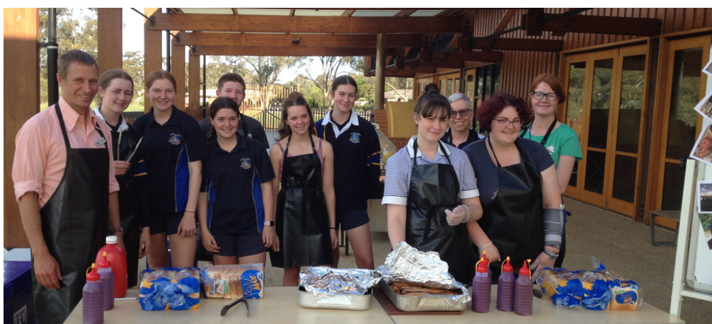
The teachers and students raising funds