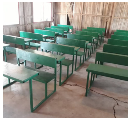
The new furniture