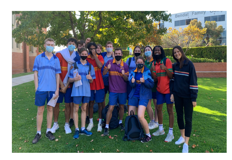
YR 11 Hermitage Retreat Day

Marist Youth Ministry Perth worked with students at Newman College, to facilitate their Game Changers retreat days. Students in years 10 and 11 had the opportunity to look at topics such as vocation, service, support networks and God's role in the decisions they make.