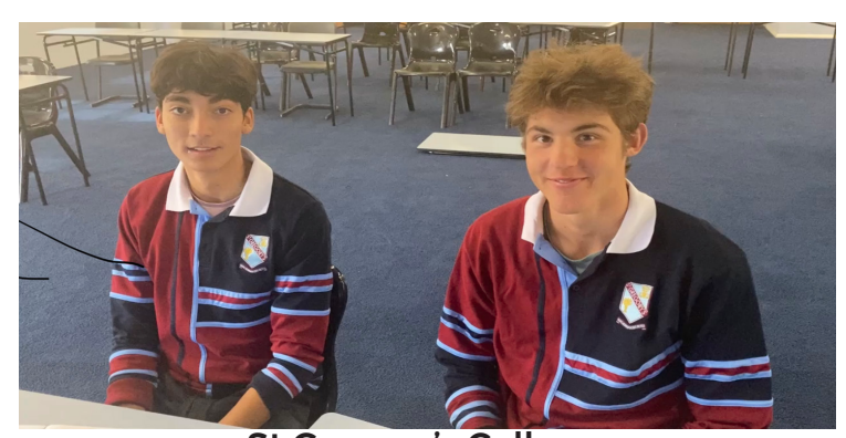
St Gregory's College

St Gregory's College, Campbelltown St Patrick's Marist College, Dundas Red Bend Catholic College, Forbes All Saints, Maitland Marcellin College, Randwick Mount Carmel Catholic College, Varroville