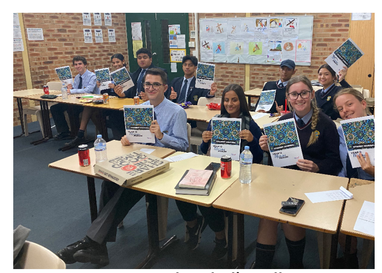
Mount Carmel Catholic College

Furthermore, students took time to just 'breathe' in prayer, students explored the principles of Catholic Social Teaching and the United Nations' Sustainable Development Goals. Students focused on making a difference in areas of gender equality, racial discrimination and climate change.