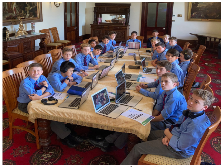
St Joseph's Catholic College