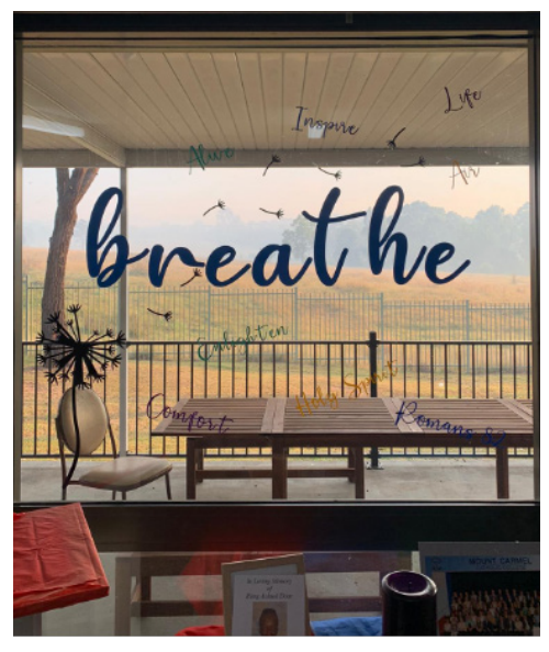
Above: A spectacular reminder of this year's theme looking out from the staff room at Mount Carmel Catholic College Varroville.

The Spirit is like a bird, fragile alloy of heaven and earth, where wind and feather and flight meets breath and blood and bones. Like a dove, she glided over the primordial waters, hovered above Mary's womb, and descended onto Jesus' dripping wet head. She protected Israel like an eagle, and like a hen, brooded over her chicks. "Hide me in the shadow of your wings," the poet king wrote. "Because you are my help, I sing in the shadow of your wings" (Psalm 17:8, 63:7). The Spirit is as common as a cooing pigeon and transcendent as a high-flying eagle. So, look up and sing back, catch the light of God in a