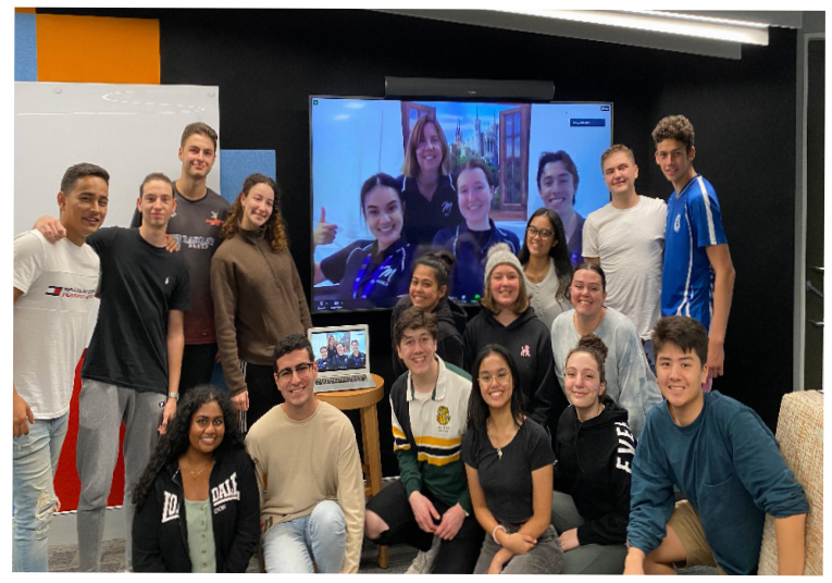
St Patrick's Marist College

We are grateful for the support of Principals and supervising staff from: