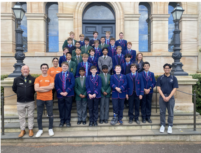
Year 8 students.

Discussions on the Le Rosey Track symbol, the Star of Bethlehem, highlighted to the students to trust in Jesus, as He is always looking out for them, especially when life gets tough! Like the star, Mary points us towards Jesus, and her life shows that we too can achieve great things if we follow her Son. After a great lunch, students met in school youth groups to discuss ways they can support and improve their own school communities! The MYM team look forward to hearing what initiatives worked well at both schools!