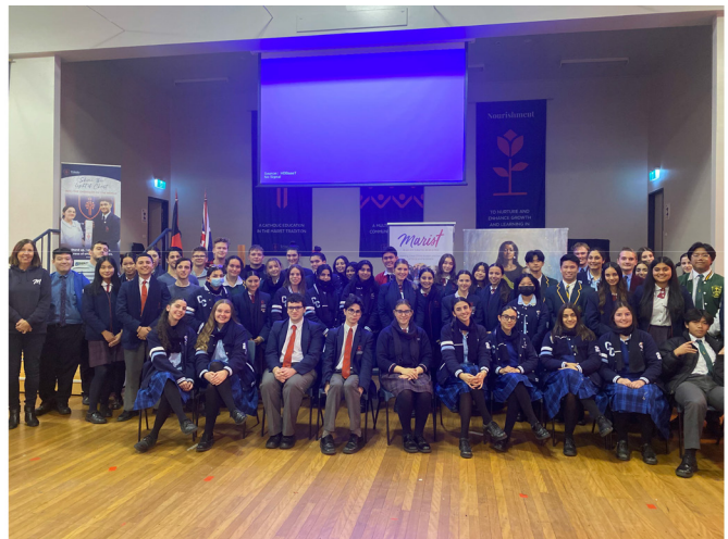
Inner west connect students.